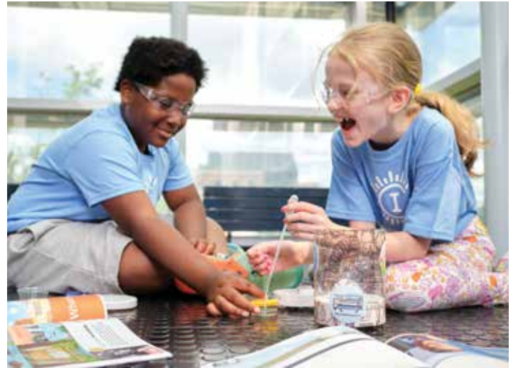
The Operation: HydroDrop experience at Camp Invention.

All local Camp Invention programs are facilitated and taught by qualified